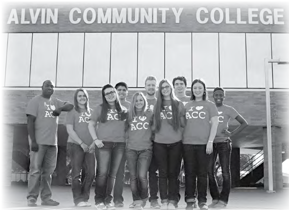
Spring 2015 Student Ambassadors

Students who register for an online section of any course must first register for ORNT 0100 before registering for an online course.