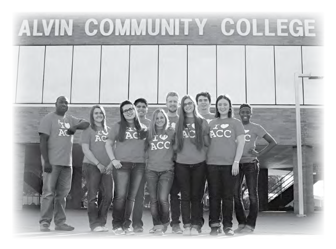
Spring 2015 Student Ambassadors

Students who register for an online section of any course must first register for ORNT 0100 before registering for an online course.